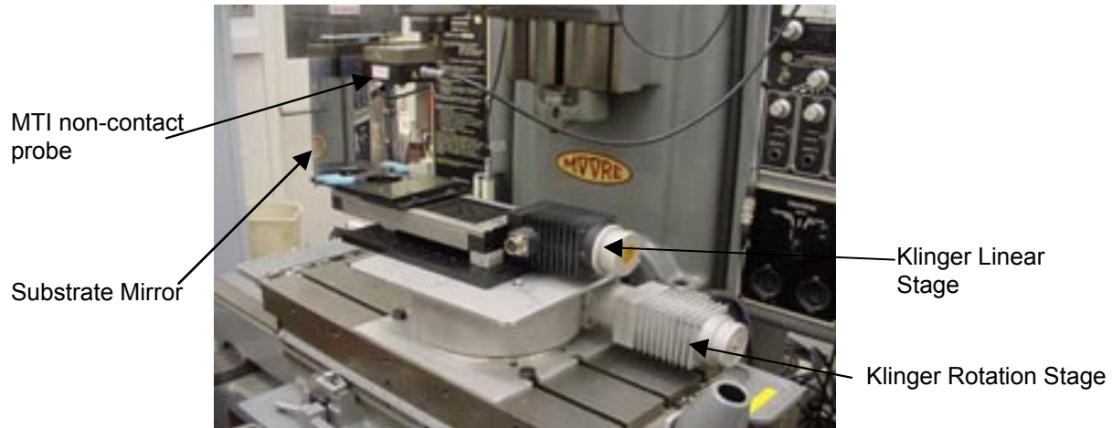
Figure 1: Moore CMM with non contact probe measuring large substrate on Klinger rotation and linear stages.

We have recently mounted a non-contact probe to the MCM. The Microtrak 7000 Laser Displacement Sensor with MT-100-5 Sensor Head developed by MTI Instruments, Inc. uses a small helium-neon laser and triangulation techniques to display surface displacements across machined surfaces such as grooves, channels or step heights. It has a standoff distance of 25.4 mm, a resolution of 0.005 microns, and a linear range of 127 microns with a nominal spot size of 36 x 56 microns. We are using it to take many measurements across an entire part in order to gain a 3-D map of its surface. The data from this controller is interfaced into a LabView computer program written at Swales Aerospace along with the data from the Axiom 2/20 Laser Measurement System with multiple organizational and manipulation features.